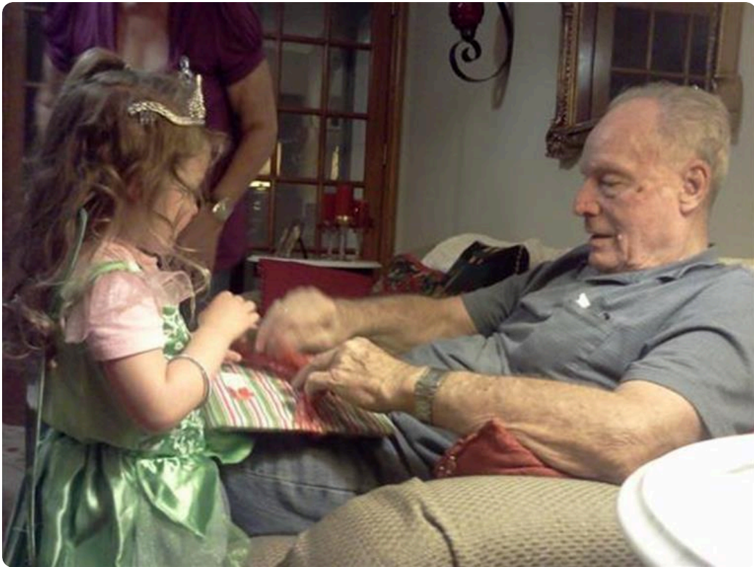
Best Grandpa Ever! Always willing to cater to his granddaughter